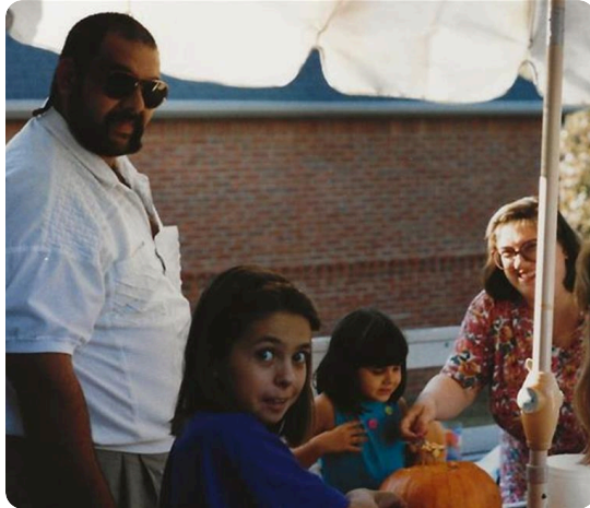
Carving pumpkins with the Szpara;s

Carol Mueller Szpara shared 4 photos to the Memories Album album. January 24 at 2:05 PM