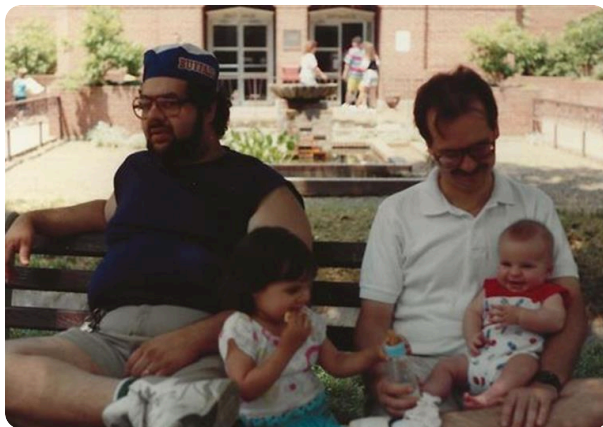
Early Memphis Years